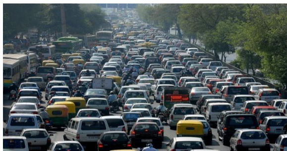
Figure 1: Complex scenario of traffic

In such a situation it becomes difficult to recognize each vehicle (object) and perhaps to find out the centroid of each object. Hence it creates problems while calculating traffic density. Another problem is while doing object subtraction, if the color of vehicle and the color of background matches then it becomes difficult to uniquely identify the object.